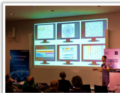
Visualising Southamptons's Web Observatory Data