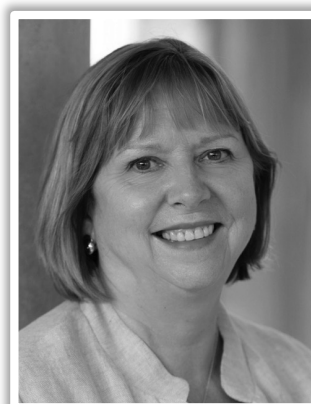
Prof. Dame Wendy Hall – Director of the WSI

In last year's event we worked with teams of researchers to come together in a study of data relating to disaster management scenarios, including forecasting and immediate crisis management and post-disaster management.